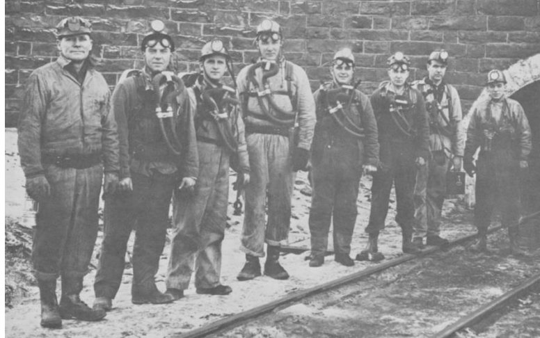
Barr Slope, Clearfield Bituminous Coal (CBC) Coporation, 1930s; and Rochester & Pittsburgh Coal Company Rescue Team at Ernest in 1930

With the passage of the Mine Health and Safety Act on 21 December 1951 a system whereby federal inspectors were empowered to shut down any mine which did not operate within the established guidelines. Operators who were found to be negligent or in violation of these regulations could be fined. Coupled with the Health and Welfare Fund this measure helped to alleviate a good deal of the hardship and suffering of the miners and their families. The beneficial aspects of this legislation was furthered by the Federal Coal Mines Health and Safety Act of 1969. This legislation included benefits for those suffering from Black Lung Disease and regulations for dust control.