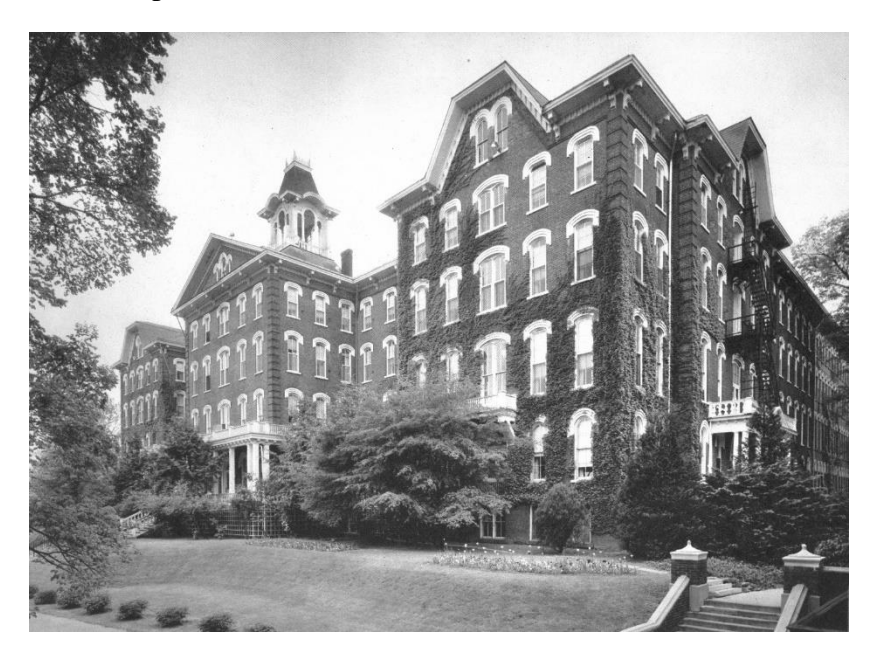
John Sutton Hall as it appeared in 1949