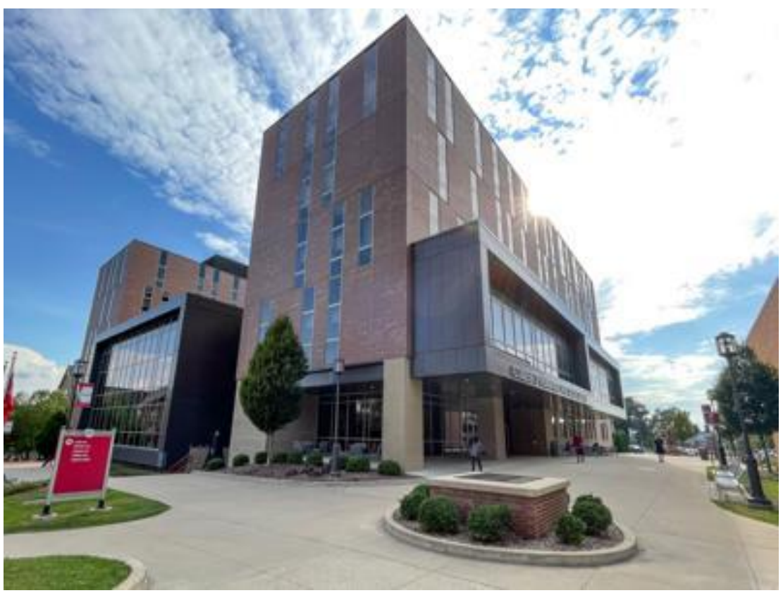
2021 Jane E. Leonard Hall, <u>IUP College of Arts and Humanities</u>