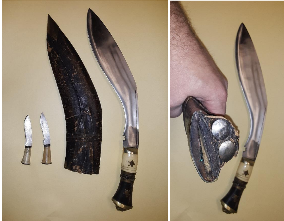
Kukri or Khukuri Knife in John P. Saylor Collection