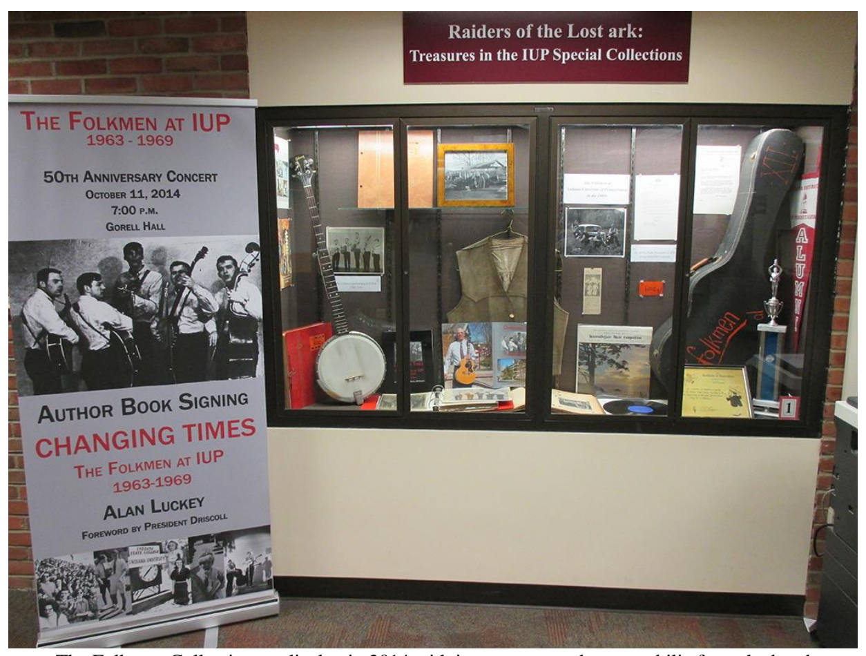
The Folkmen Collection on display in 2014 with instruments and memorabilia from the band

This collection was processed by Harrison Wick and the finding aid was updated on July 25, 2024.