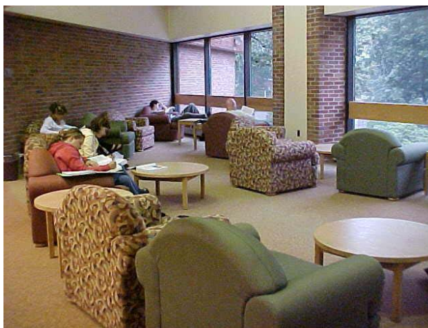
The Norma A. Beaumont Alcove Second Floor Stapleton